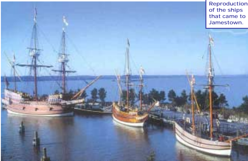
Reproductions of the ships that came to Jamestown.