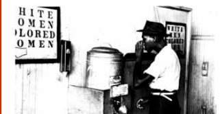
Separate Drinking Fountains and Restrooms