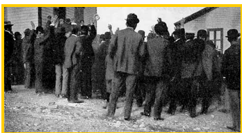
Waiting in Line to vote