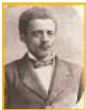
African American men elected to office during Reconstruction.

During Reconstruction, African Americans began to have power in Virginia's government, and men of all races could vote.