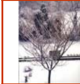
In winter, they hunted birds and animals.

The kinds of food they ate, the clothing they wore, and the shelters they had depended upon the seasons.