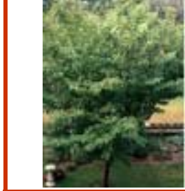
In summer, they grew crops: beans, corn, squash.