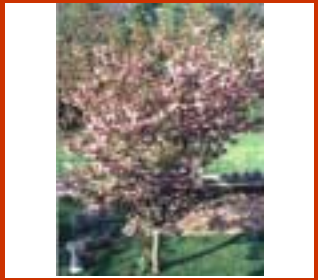
In spring, they fished and picked berries.