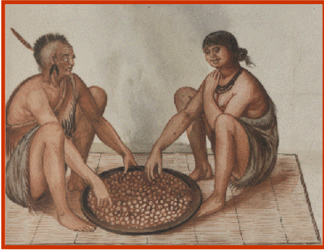
Animal skins (deerskin) were used for clothing.