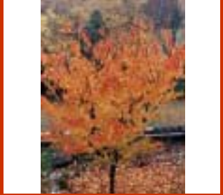
In fall, they harvested crops.